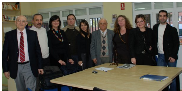
Group discussion on the Digital Library

Project Newsletter no. 1 - December 2008