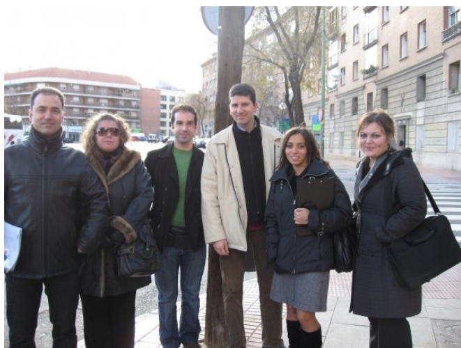
Some Greek and Turkish Participants